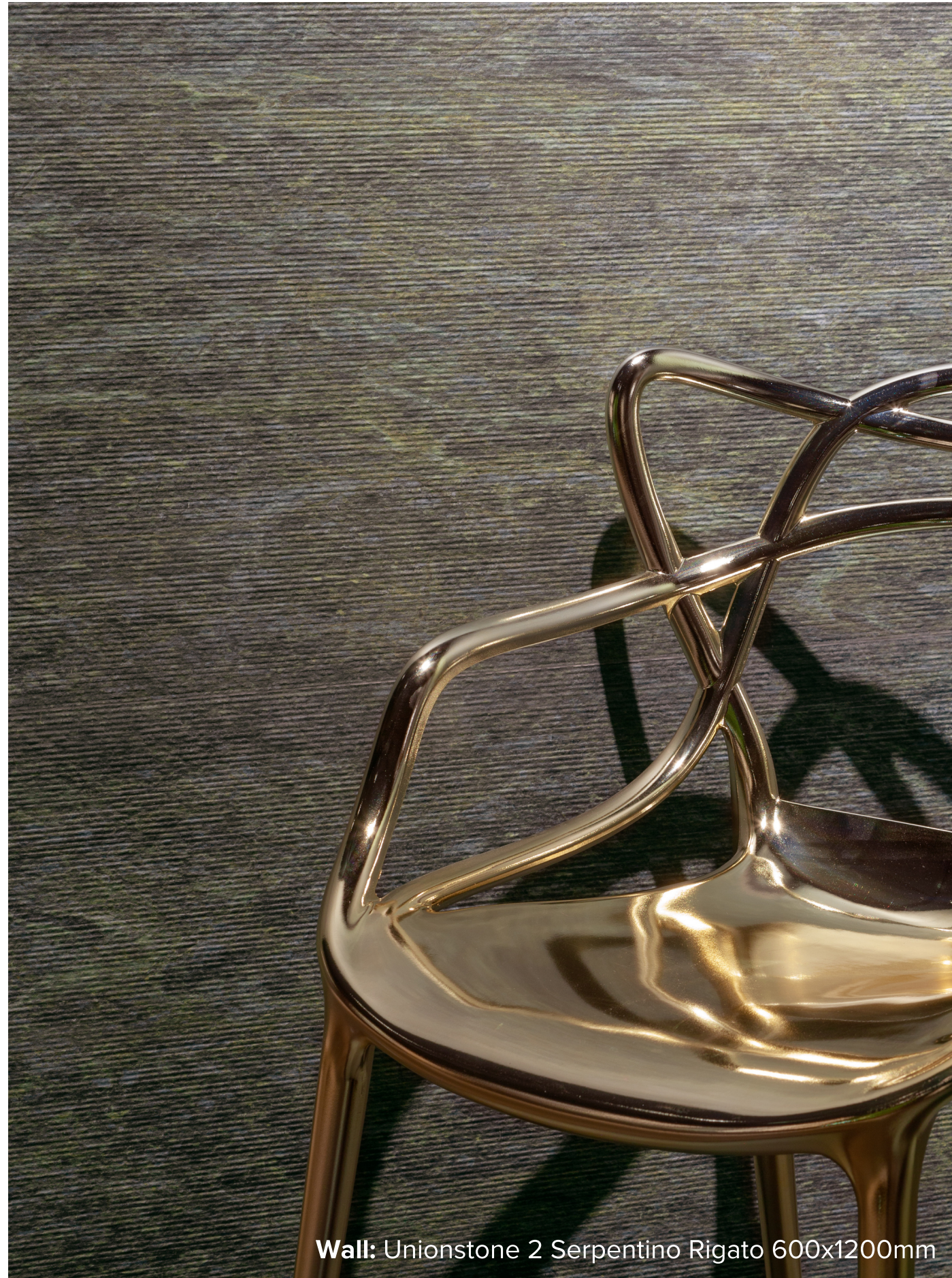
Wall: Unionstone 2 Serpentino Rigato 600x1200mm