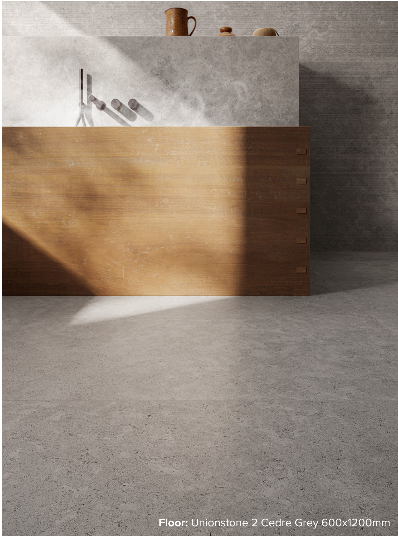
Floor: Unionstone 2 Cedre Grey 600x1200mm