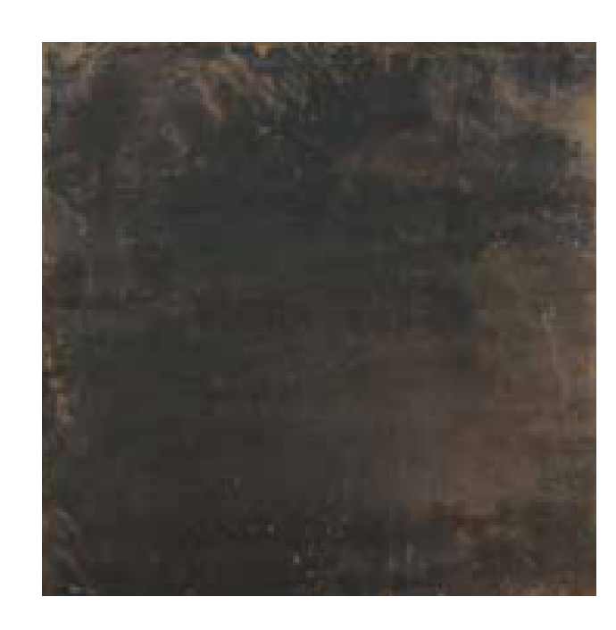
196x196mm RECTIFIED 8499