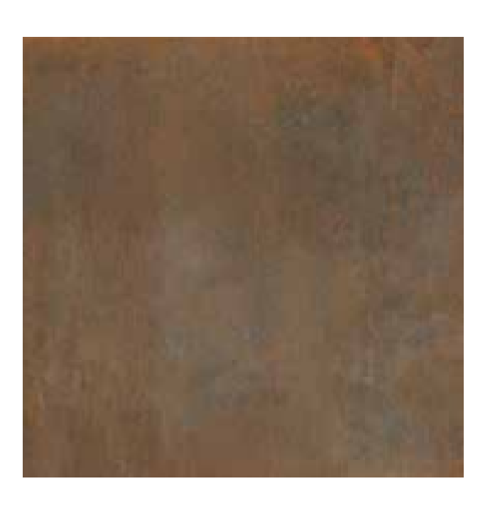
196x196mm RECTIFIED 8498