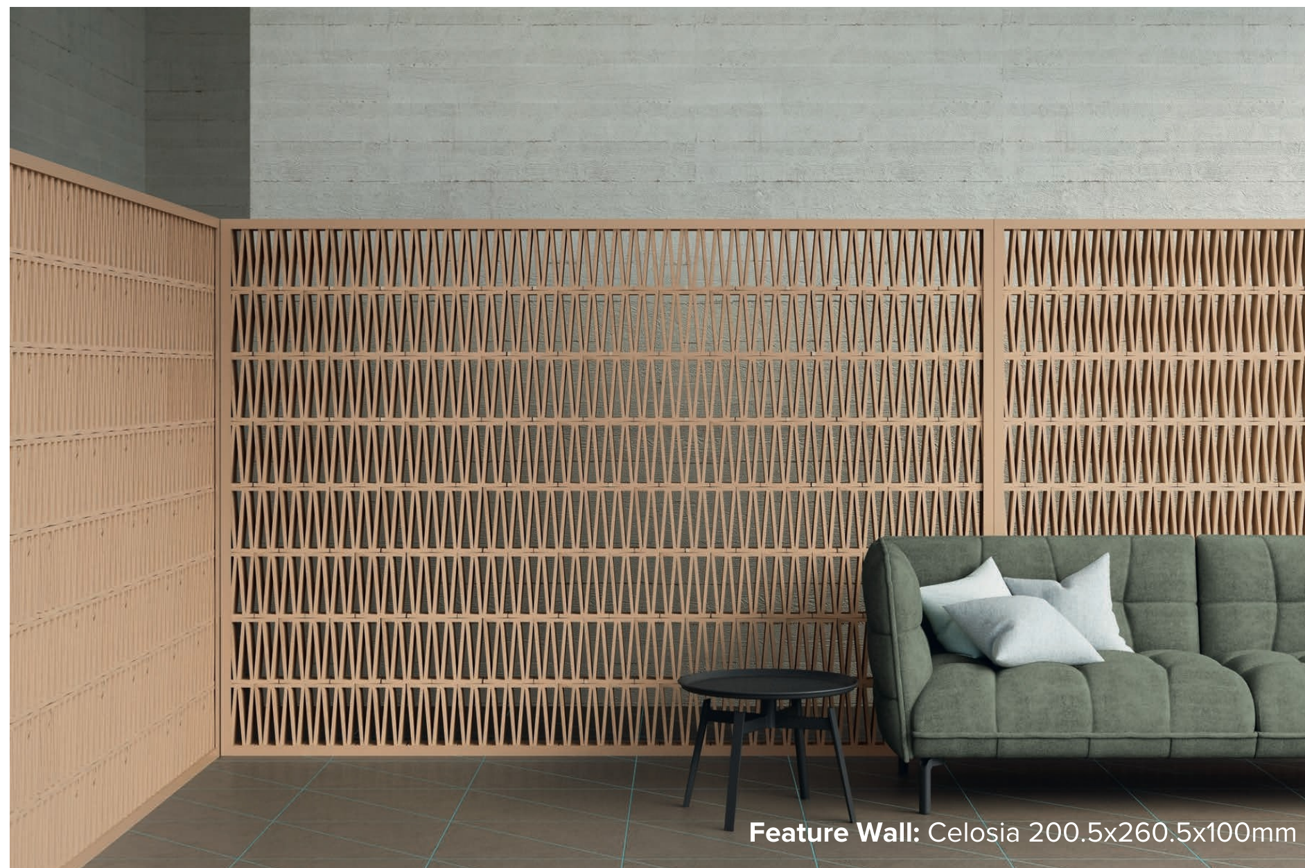
Feature Wall: Celosia 200.5x260.5x100mm

PRODUCT TYPE: EXTRUDED TERRACOTTA CERAMIC