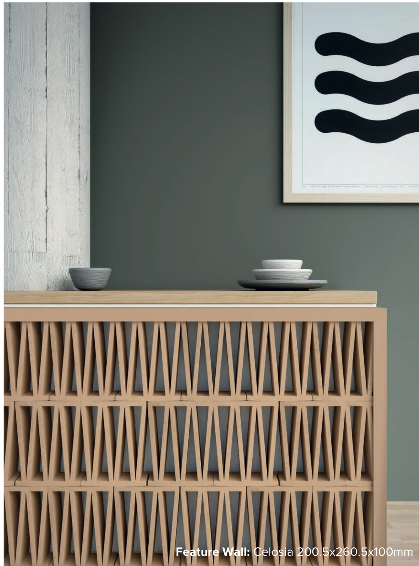
Feature Wall: Celosia 200.5x260.5x100mm