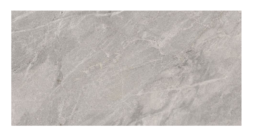
600x1200mm RECTIFIED 1994