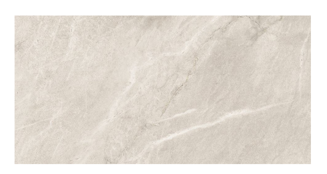
600x1200mm RECTIFIED 1401