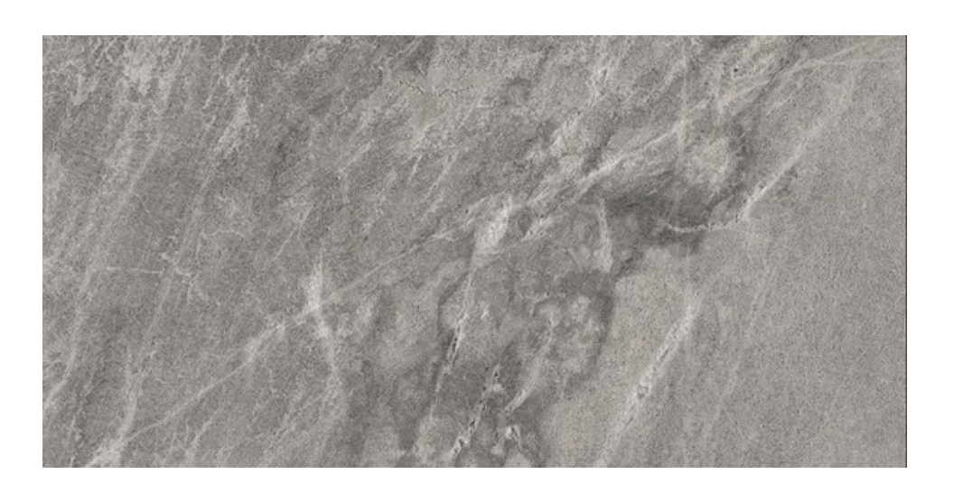
600x1200mm RECTIFIED 1993